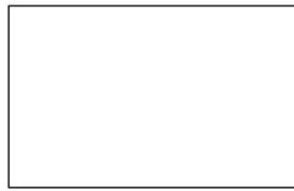
WHITE DIAMOND* [Surcharge of RM800 is applicable]